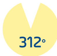
Revolution Lighting Light Distribution